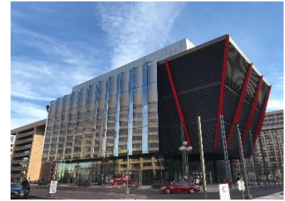
International Spy Museum – Custom steel and glass veil, Skylight, Returnwalls and soffit glass systems fabricated and furnished by Roschmann

Owner: The JBG Companies Architect: Rogers Strik Harbour + Partners General Contractor: Roschmann Steel & Glass Construction Contract Amount: $660,000 Date of Completion: April 2018