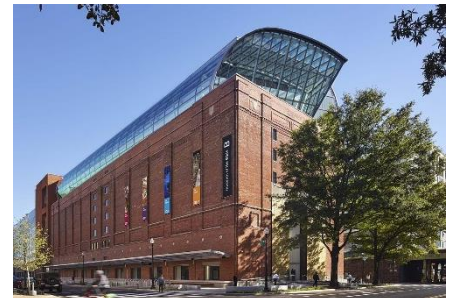
Museum of the Bible – Custom steel and glass barrel vault, profilit channel glazing and custom art-wall glass systems fabricated and furnished by Roschmann

Owner: Museum of the Bible Architect: Smith Group JJR General Contractor: Roschmann Steel & Glass Construction Contract Amount: $1,298,000 Date of Completion: September 2017