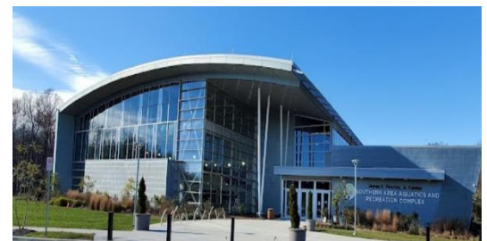
SARRC – Curtainwall, automatic entrances, custom interior glazing, exterior energy efficient glass and glazed in metal panels.

Owner: Maryland National Capital Parks and Planning Comm. Architect: Hughes Group General Contractor: Coakley Williams Construction Contract Amount: $1,335,000 Date of Completion: November 2019