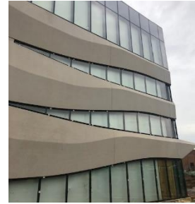
PSU Parking Deck – Custom serpentine curtainwall.

Owner: Penn State College of Medicine Architect: FS Architecture General Contractor: Clayco Contract Amount: $1,230,000 Date of Completion: January 2020