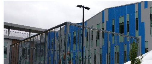
Kipp DC – ACM panels, Curtainwall, Screen wall, Operable Vent windows.

Owner: Kipp DC Architect: Studio Twenty-Seven Architecture General Contractor: MCN Build Contract Amount: $1,101,800 Date of Completion: February 2021