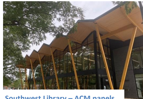
Southwest Library – ACM panels, Curtainwall and energy efficient glass.