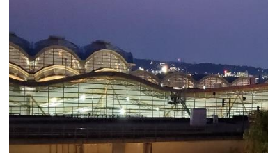
Secure National Hall at Reagan National - Sage Electrochromic Glazing in Fre-Marq Curtainwall System

Owner: Washington Metropolitan Airport Authority Architect: AECOM General Contractor: Turner Construction Contract Amount: $9,565,291 Date of Completion: July 2021